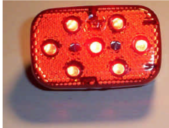
Red or Clear Case Dimensions for lights 1 through 6: 2.75" by 1.75" by 1.5".